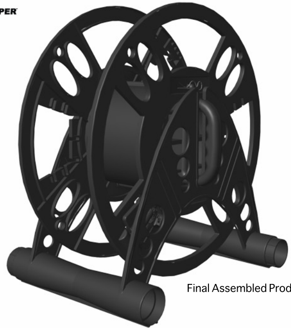
Final Assembled Product